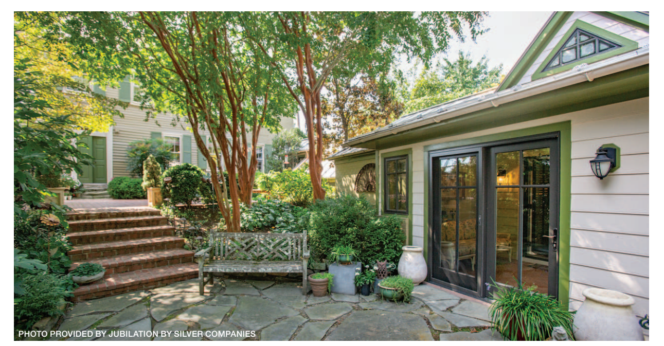
Home of the Suvals prior to moving to Jubilation

"You can't possibly move everything, but you do find creative ways to keep a memory alive," she said.